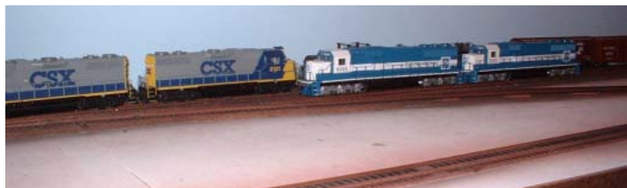
Here is a meet with the switch engines that are stationed at Decatur.