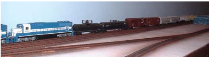
The Central Soya local has made it up the helix to Decatur, Indiana.