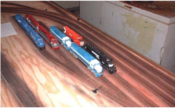
This is Mark's engine facility. This is were it all starts.