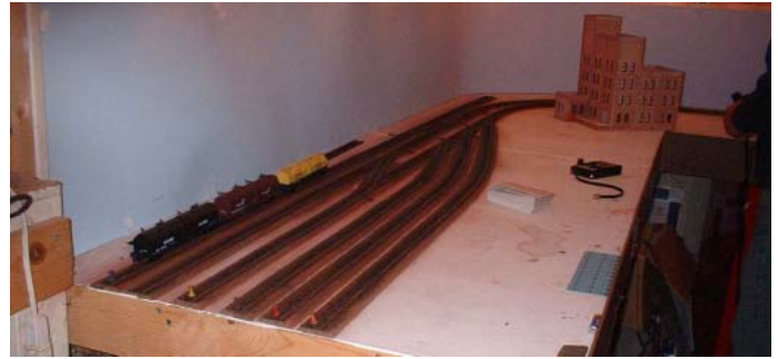
This is the Steel Dynamic Plant.