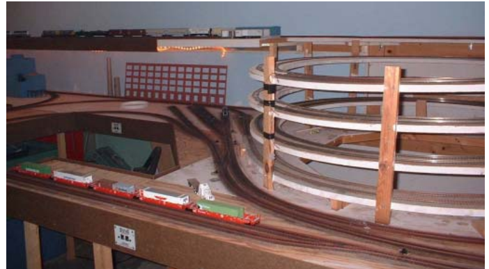
This is the helix with the power plant and the inter model facility shown.