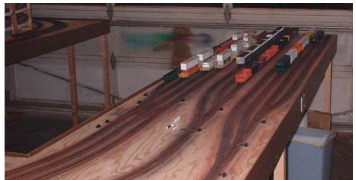
This is the visible staging yard.