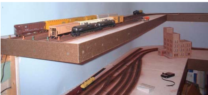
The top is Decatur Indiana, Central Soya; the bottom is the Steel Dynamic Plant.