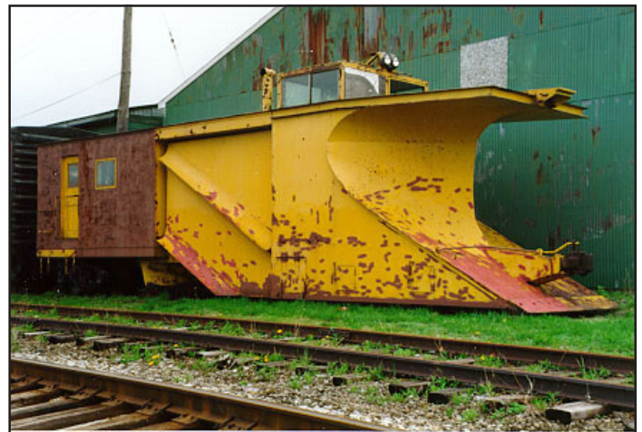
Russell snow plow

This information came out of "The Soo", Volume 17, Number 1, Winter 1995, pp.16-41.