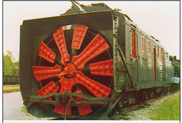
Rotary snow plow

• The most successful snow-fighting gets done in the summer. Rights-of-way are being regraded to eliminate places where deep drifts collect.